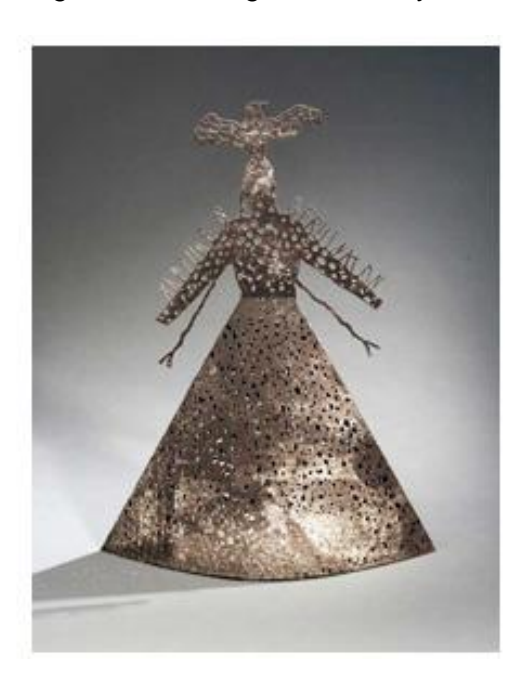
Lesley Dill, 3D lithograph

Consideration of the ways experience can be distilled in computational space, the transformative relationship of materials to idea through digital means, and the translational aspects of multi-disciplinary work is an exciting set of developments. This panel will investigate the vigorous exchanges offered by the contemporary hybridization of the forms of the print.