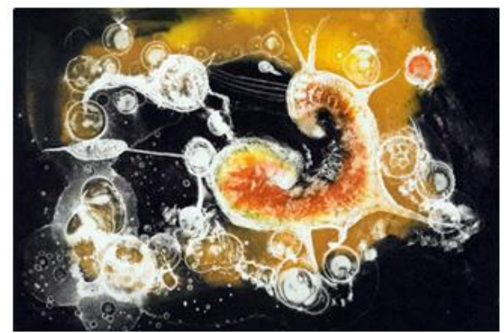
Paul Catanese Digital relief print